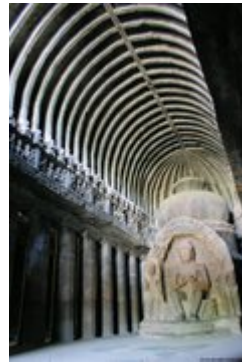
"Carpenter's Cave" Ellora's most famous Buddhist caves